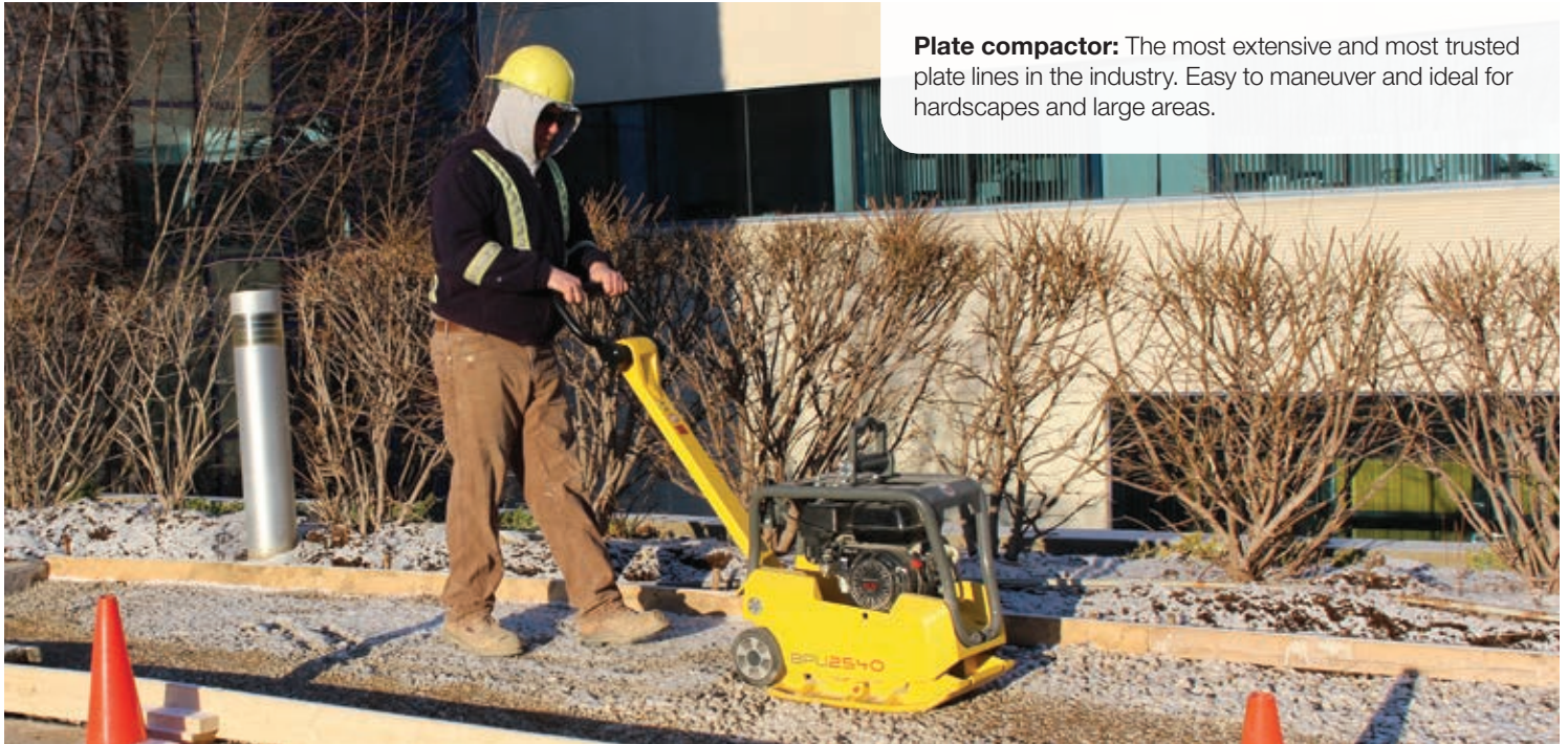
Plate compactor: The most extensive and most trusted plate lines in the industry. Easy to maneuver and ideal for hardscapes and large areas.

We can provide all the equipment a landscape professional needs, from pumps to rammers, rollers and compactors. Wacker Neuson's wide range of light equipment, along with our service and warranty coverage, represents durable value that performs in any number of landscape applications.